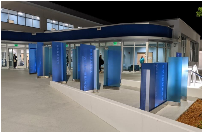
"Building Up Community" by Krivanek+Breaux. 2020