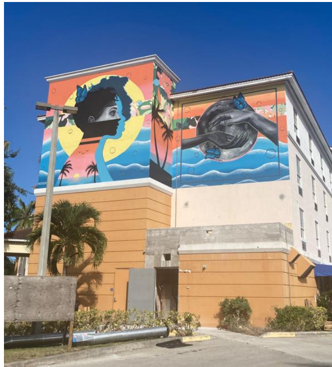
NB Hospital by Koco Collab, 2022