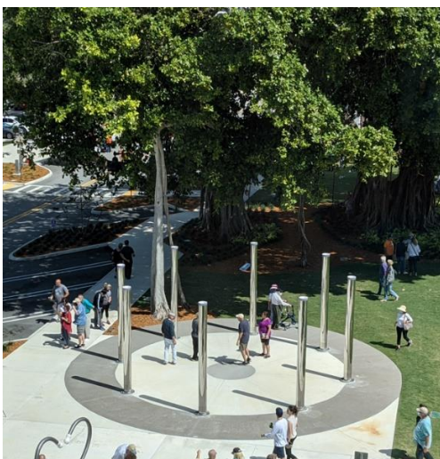
"Synesthesia" by Donald Gialanella Sound and Light Interactive Space, 2020