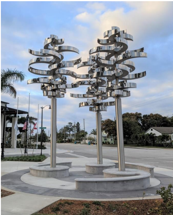
“Reflections” by Ralfonso, 2020